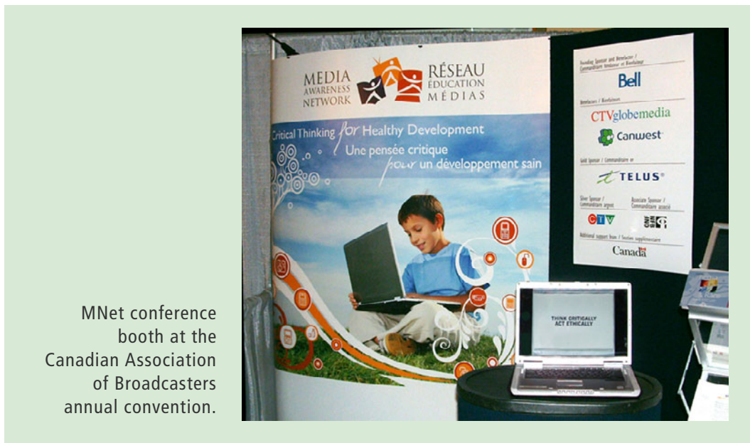
MNet conference booth at the Canadian Association of Broadcasters annual convention.