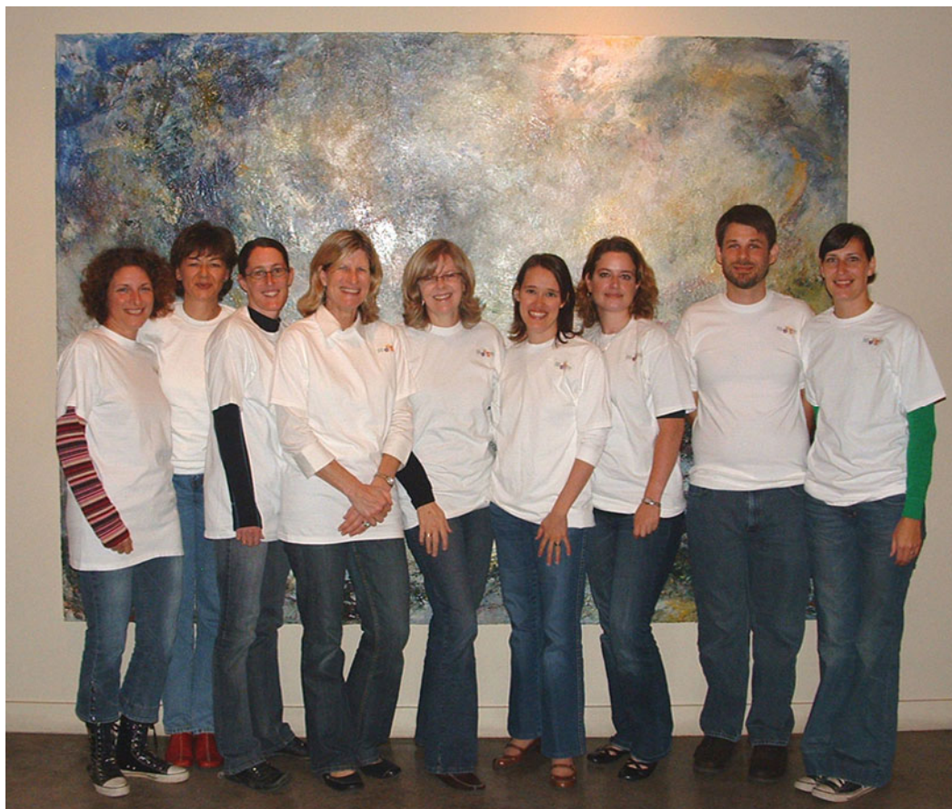
MNet staff retreat October, 2008