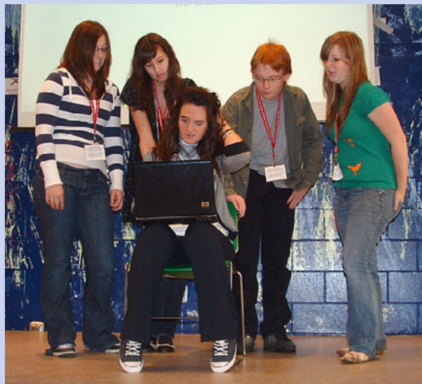
Students from Historica's Encounters with Canada youth forum during the National Media Education Week media event.