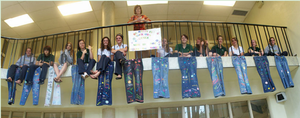
The Jeans Project by the Grade 12 Women in Society class at St. Patrick's High School in Sarnia, Ontario, was featured during National Media Education Week.