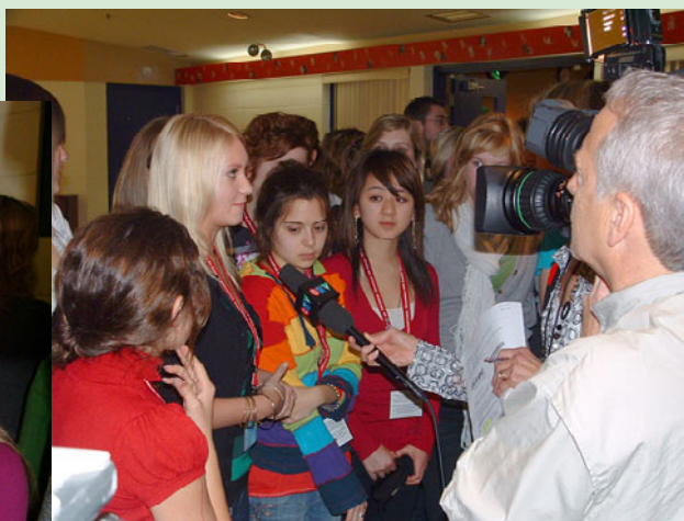
Students from Historica's Encounters with Canada youth forum are interviewed by CJOH News at the National Media Education Week media event.